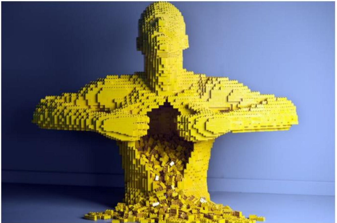
Lego has been named top brand for 2018 (Image: Erica Ann)