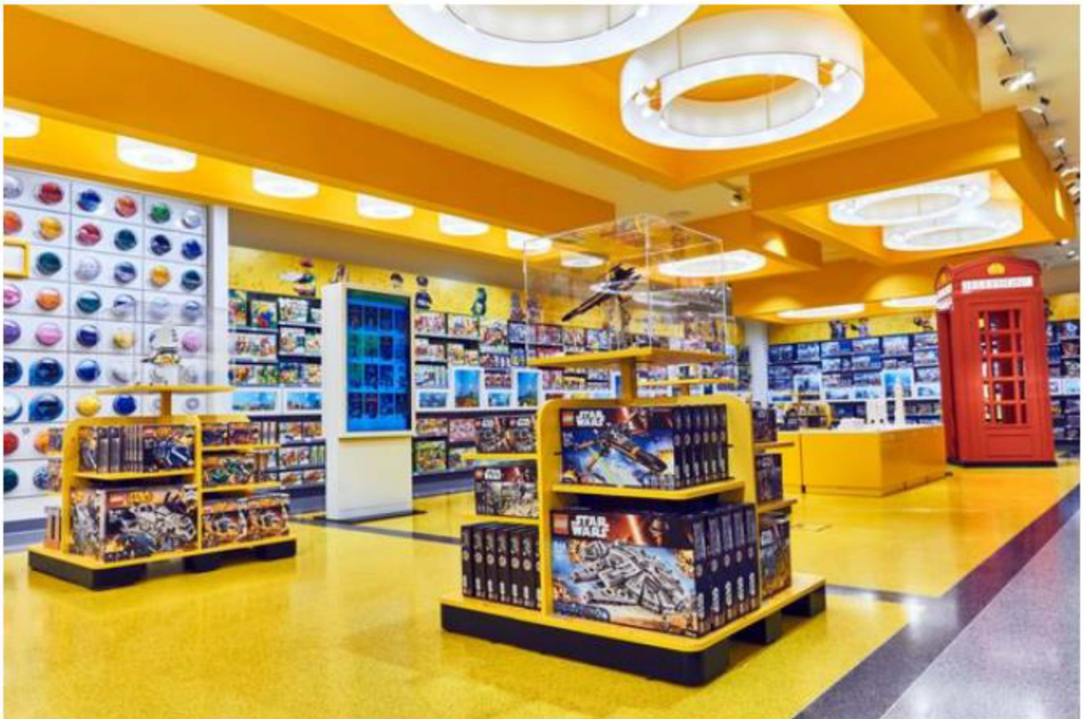
Lego ended BA's run at the top